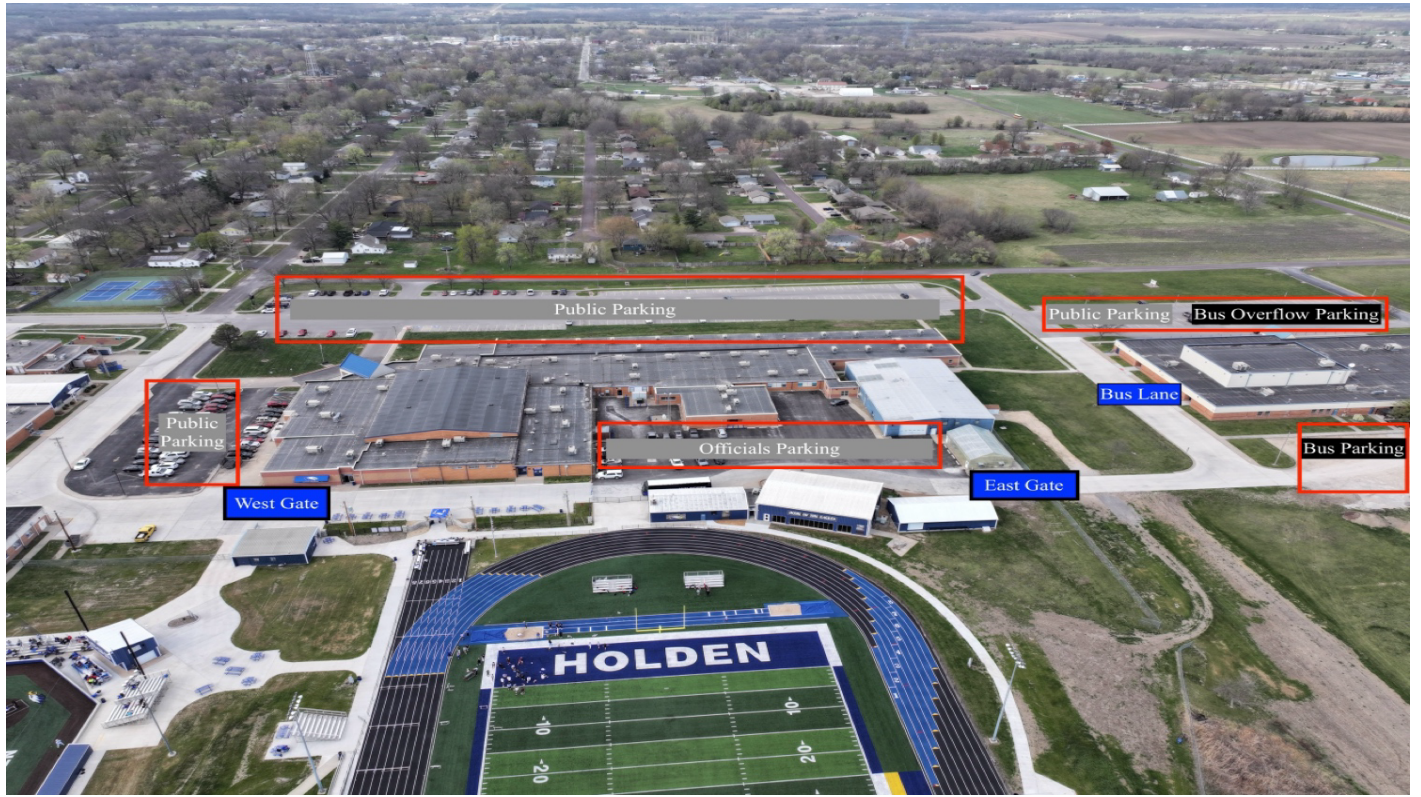
Overhead (track view)